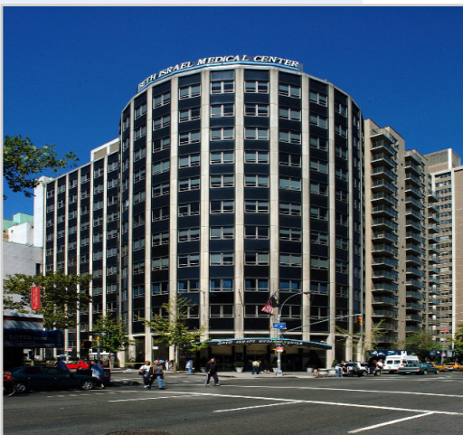
Beth Israel Medical Center

Continuum has effectively eliminated the need to do traditional disaster recovery should a calamity happen. Whereas many IT organizations normally go through a painful process of assembling resources to recover data following a site-wide outage, the metro clusters at Continuum Health Partners allow them to take over operations from their hot site uninterrupted.