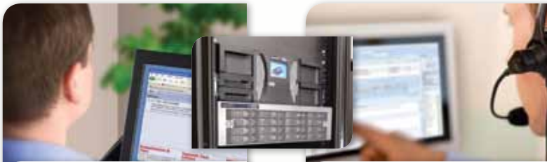
T50e Remote Access

The Spectra T50e offers encryption and key management as seamless, integrated standard features. Spectra's BlueScale Encryption utilizes AES-256 bit encryption through the library for LTO tape drives. It lets you seamlessly and affordably add encryption to your backup strategy, with no changes to backup policies and no additional hardware or software